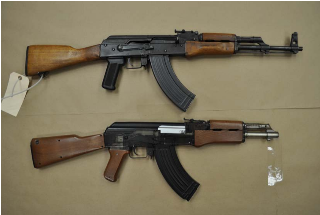
A close-up comparison of an AK and the replica.