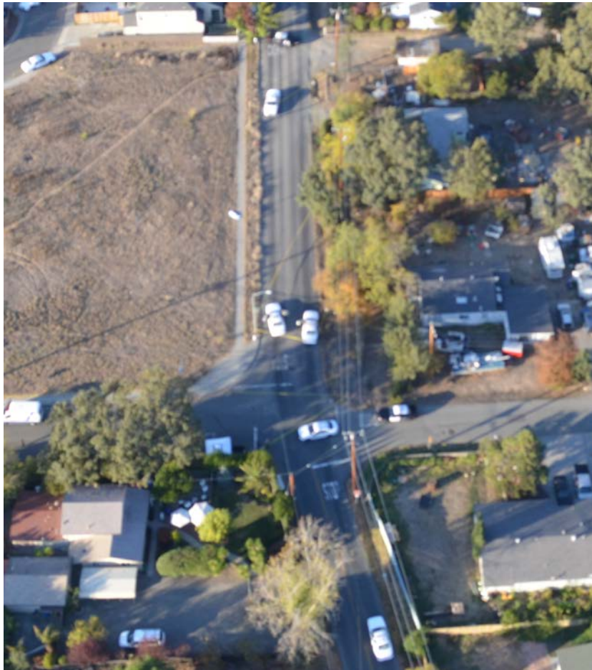
Overhead photo of the scene.

While approaching the intersection, Deputies Gelhaus and Schemmel both observed a male subject walking on the sidewalk, just north of the intersection. The subject, later identified as Andy Lopez, was walking northbound on the sidewalk along the west side of Moorland Avenue (away from the intersection).